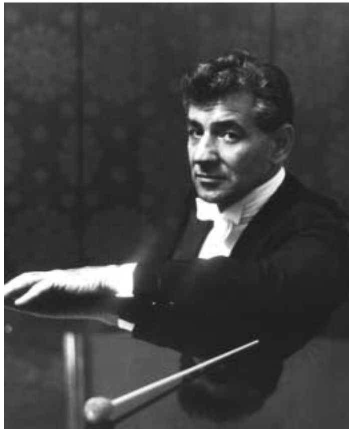
Bernstein during the Philharmonic Years .

Bernstein recorded around 500 works for Columbia from 1950 through the 70's with the New York Philharmonic. To date, 80 Bernstein Century CD's are