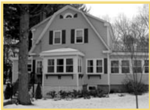
The Bernstein's home in Sharon, Massachusetts.

The Bernstein family had a strong link to Sharon, where Bernstein spent his teenage summers directing, accompanying and acting in performances of Gilbert and Sullivan as well as Carmen , no less!