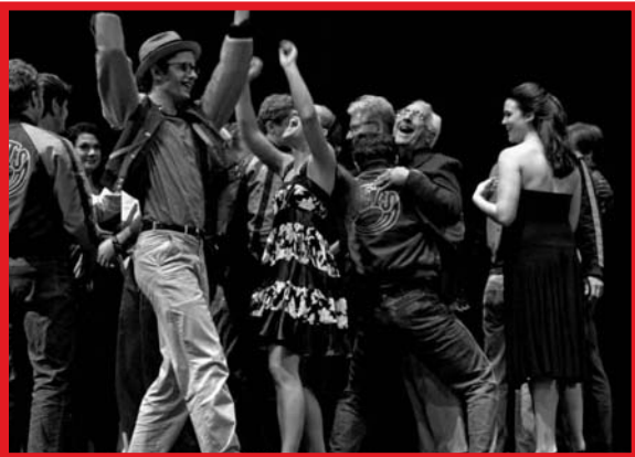
NORTH CAROLINA SCHOOL OF THE ARTS