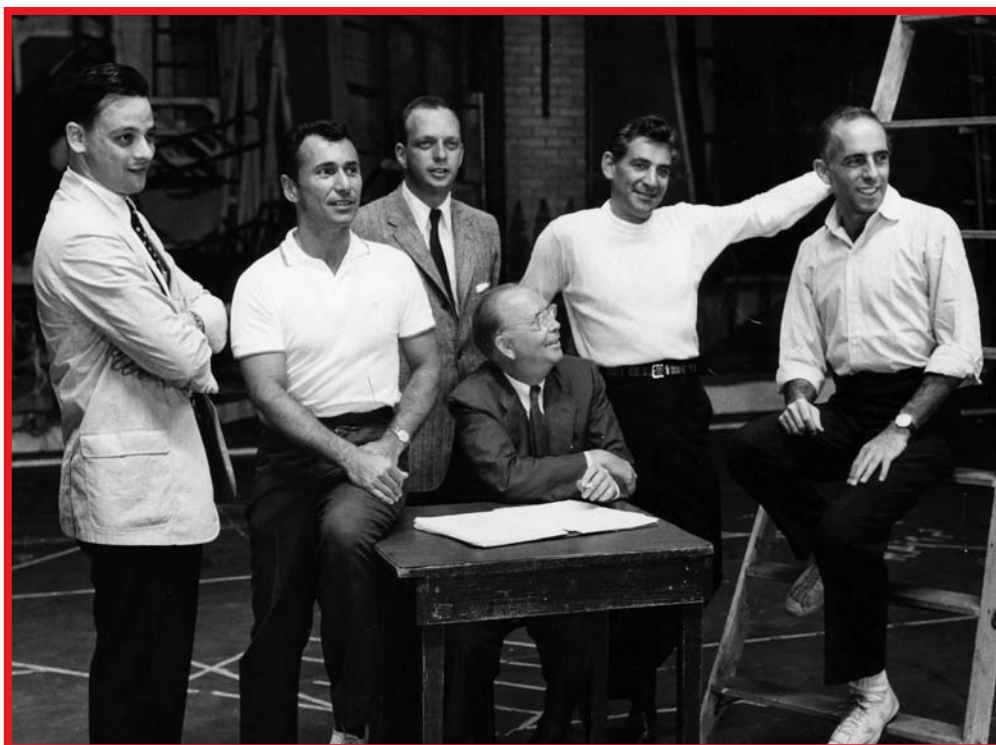
Left to Right: Stephen Sondheim, Arthur Laurents, Harold Prince, Robert E. Griffith, Leonard Bernstein, and Jerome Robbins, circa 1957.

Although I came in late on the show, progress was not so considerable. Arthur had written a three-page synopsis of the action (no dialogue yet), and Lenny had written only the chorus of “Cool” and the opening bars of “Maria” (apart, of course, from the tunes like “Krupke,” “One Hand” and “America!,” which he had written for previous projects and which