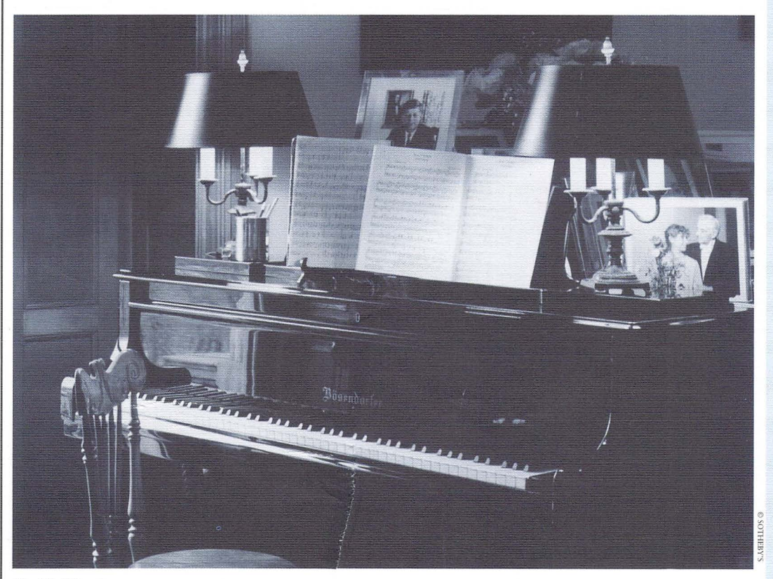
The "B-52" at home.