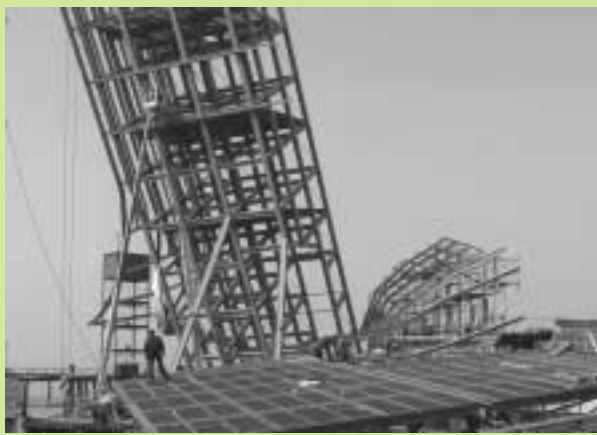
Construction of WSS floating set.