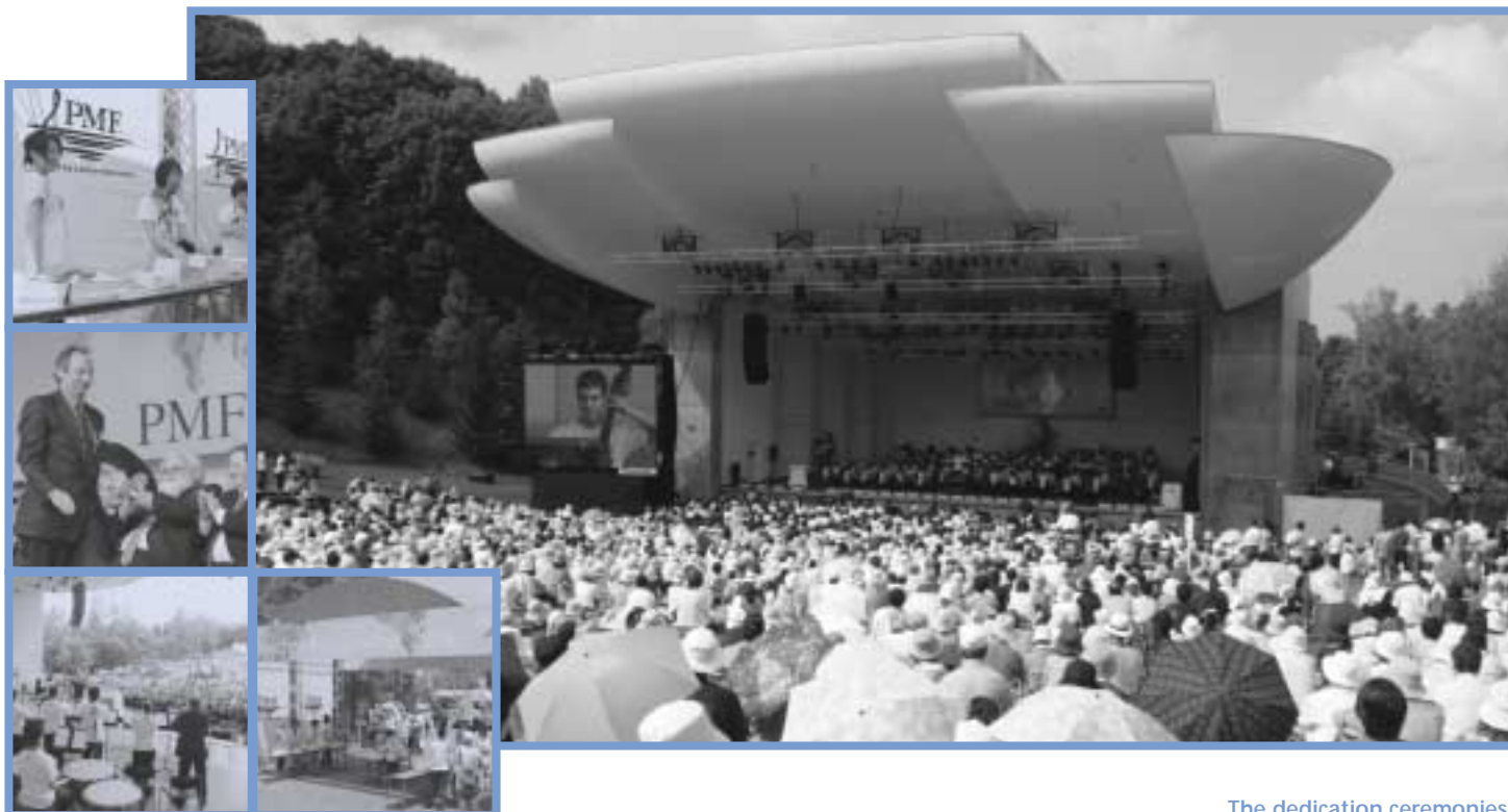
The dedication ceremonies