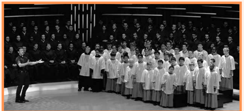
The American Boychoir perform in MASS .