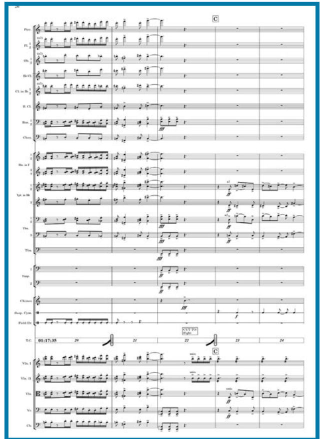
Scramble cue: Bernstein's manuscript short score, and the new edition and adaptation.