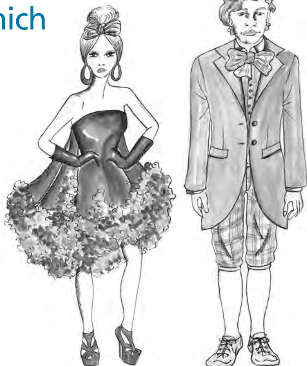
Costume design for Candide in Munich.