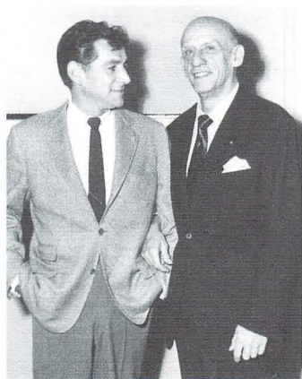
Bernstein and Mitropoulos, 1956.

Firstly, in 1948, Mr. Bernstein allegedly confirmed to Serge Koussevitzky that Mitropoulos was a homosexual and therefore an unacceptable choice as his successor. This tawdry and preposterous tale would only begin to make even partial sense if Koussevitzky had had the power to name his successor — which demonstrably he didn't: he'd