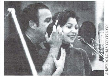
Mandy Patinkin and Donna Murphy.

Nonesuch records plans to release LEONARD BERNSTEIN'S NEW YORK . This recording features Mandy