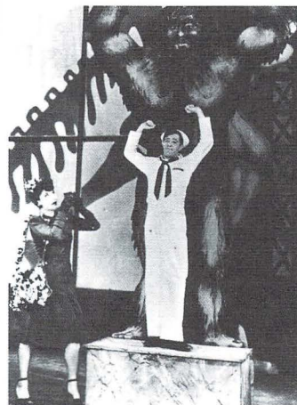
Betty Comden and Adolph Green in ON THE TOWN , 1944.

"I moved to New York after graduating from Mount Holyoke. I was 20: totally naive and sheltered. Of course, my parents thought New York was the City of Sin, but they allowed me to go because my big brother was there to look after me.